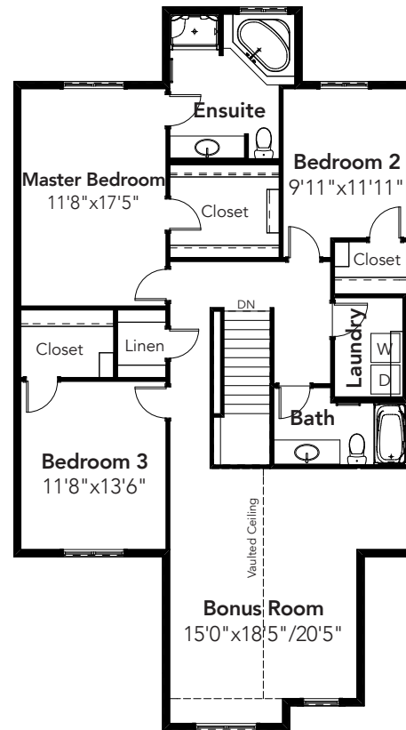
SECOND: 1486 SQ. FT.